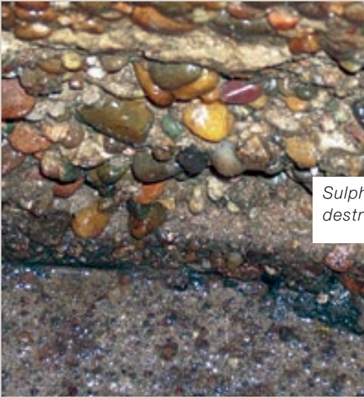
Sulphuric acid has destroyed the concrete.

Attack by acids can be stopped by the seamlessly sprayed barrier-film of 2K Polyurea Elastocoat. Elastocoat seals long-term. Curing in seconds, the »liquid film« moulds itself to all shapes of surface achieving a trouble-free sealing of vertical surfaces. It has excellent crack-bridging properties with 400% elongation at break. The result is a high-grade and durable repair.