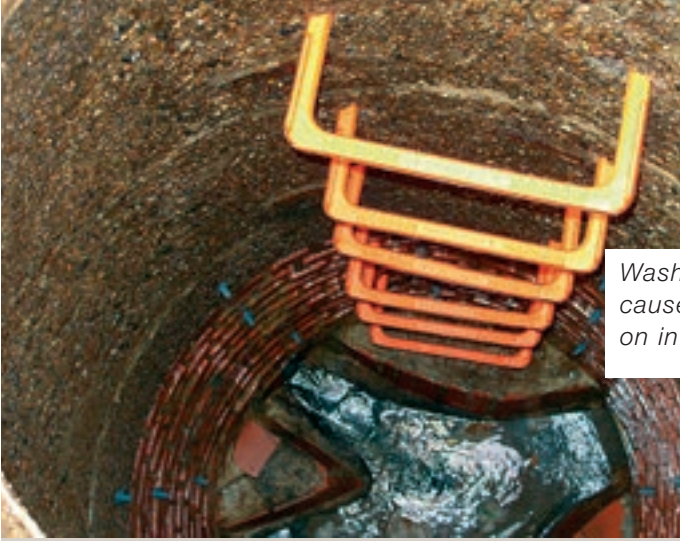
Washed concrete look caused by acid corrosion in a manhole.

Biogenic sulphuric acid generated by the bacteria Thiobacillus in gas-sealed manholes, slurry systems or biogas plants rapidly lead to heavy concrete corrosion. Washed concrete appearance and decomposed metal components are typical signs of damage such as corrosion, crack formation and leakage. The result can be instability of the structure as well as infiltration.